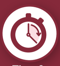
Time & Attendance